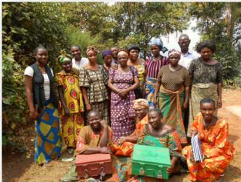
TFV beneficiaries at a MUSO in S. Kivu with TFV partner KAF in Bagira, DRC.

As the TFV moves toward putting its new strategic plan into action, it will be important to prioritize the documentation of the impact of these projects, assessing and replicating effective models, and scaling up to reach even more of the many thousands of victims who are still in need of assistance.