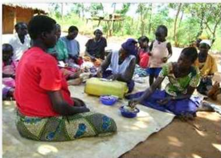
Members of Lapit pe Kun VSLA group in Kitgum district, Uganda during a loan disbursement in one of their saving days.

The ICRW team of evaluators, including the local consultants hired in each country, were neutral parties with complete independence in regard to their interests in evaluation findings. However, at times during the fieldwork in DRC, additional local language skills were required to communicate with victims in their own language, and these skills were available only among the TFV staff. This may have produced a social desirability effect, limiting the degree to which respondents felt they could express their true opinions. However, based on the candid and often critical remarks provided through these translations, and the high degree of professionalism demonstrated by the TFV field staff, the evaluation team is confident that this did not compromise independence nor provide any undue influence on victims' comfort in responding honestly.