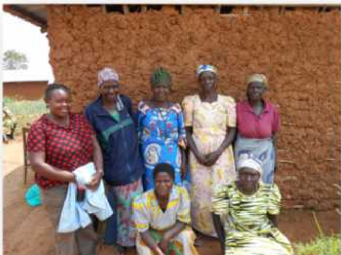
TFV beneficiaries from the community reconciliation project in eastern DRC, Noyo Pacifique de Mamans.

This evaluation provides evidence of the great strides made by the TFV-supported projects in the name of assistance to victims under the jurisdiction of the ICC. As the TFV moves toward putting its new strategic plan into action, it will be important to prioritize the documentation of the impact of these projects, assessing and replicating effective models, and scaling up to reach even more of the many thousands of victims who are still in need of assistance.