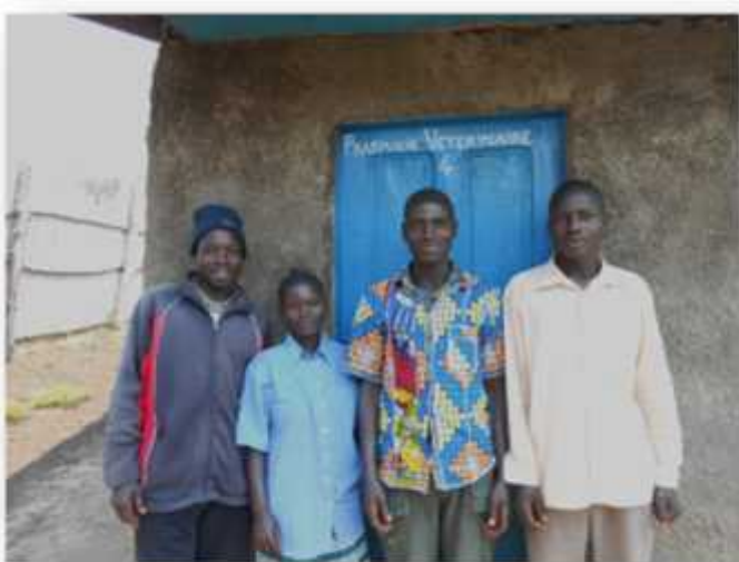
TFV beneficiaries in the veterinary medicine vocational training track, eastern DRC.