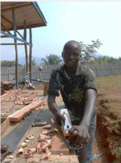
TFV beneficiary in Mahagi, DRC.